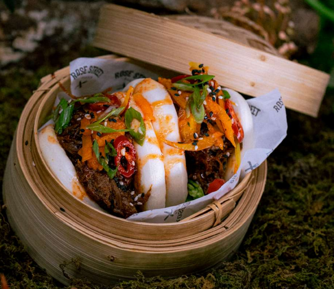
Short Rib Bao