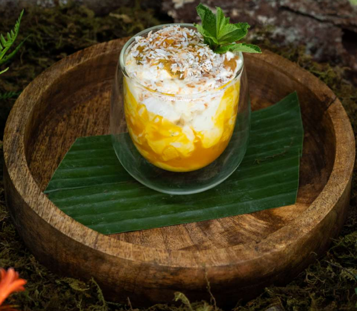
Mango passion eton mess